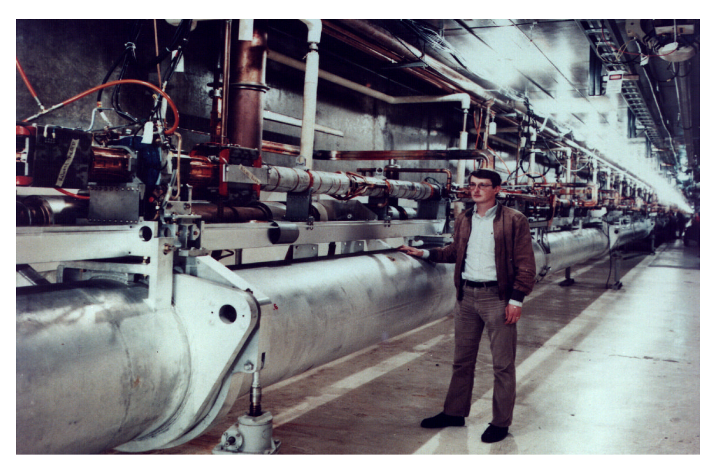
The Stanford Linear Accelerator