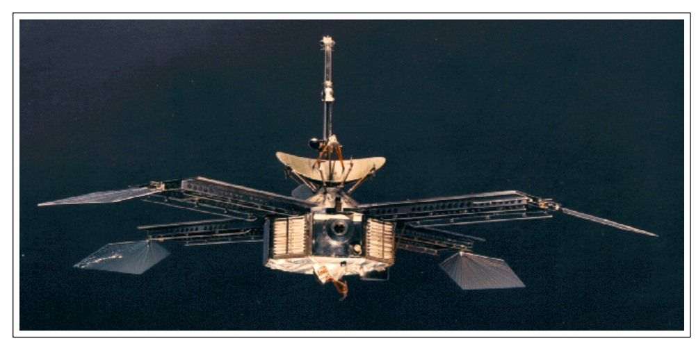
Radio contact between Mariner 4 and earth's tracking stations was limited by the speed of light. God's universal communications system is INSTANTANEOUS!

qualities of the God Family. After Christ was ACTERS out of mortal mankind -- literal resurrected and in His spirit body, did He BORN Sons of God's Family! SUDDENLY APPEAR to His disciples? John 20:19. Then is God capable of passing through was complete only in the PHYSICAL sense. solids such as doors and walls? Same verse. He was created a perfect physical specimen --(Notice that the doors were LOCKED!) What but NOT a perfect SPIRITUAL creation! He was their reaction? Luke 24:36-37. Did He was created WITHOUT the divine SPIRIalso manifest Himself in a PHYSICAL BODY TUAL POWER which God has made available of flesh and bone that could be FELT? Verse to all mankind -- the power to ACCOMPLISH 39 .